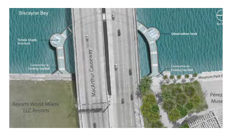
Illustration by Zyscovich Architects in collaboration with Curtis and Rodgers